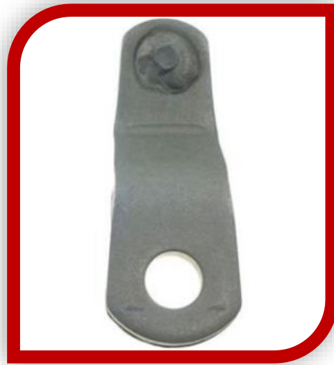
Ford part #E7T2-7A554-A

A new tube kit, Ford part #F5TZ-7A512-A, and pedal pivot shaft lever, Ford part #E7T2-7A554-A, must be used with the upgraded parts.