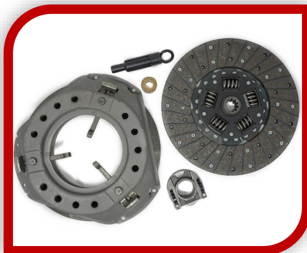
Original Lever Style Option