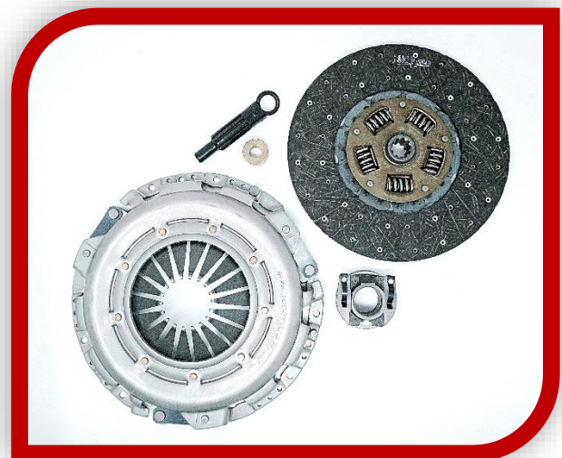
Diaphragm Style Spring Upgrade