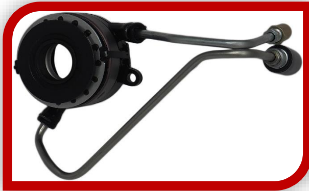
PDL N1756 Example