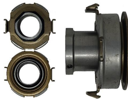
N051SAR (Included in the above kits)

The release bearing with repair sleeve offered in our kits is an inexpensive , and easy to install alternative to the case replacement.